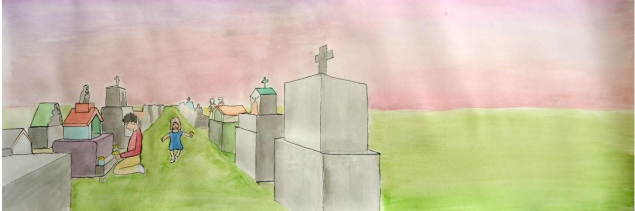
Figure 3. Artwork by Sanford Fels, a high-school student in upstate New York.